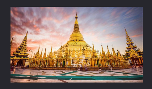
4/16/2019 - Burmese New Year 5/15/2019 - Polynesian Day