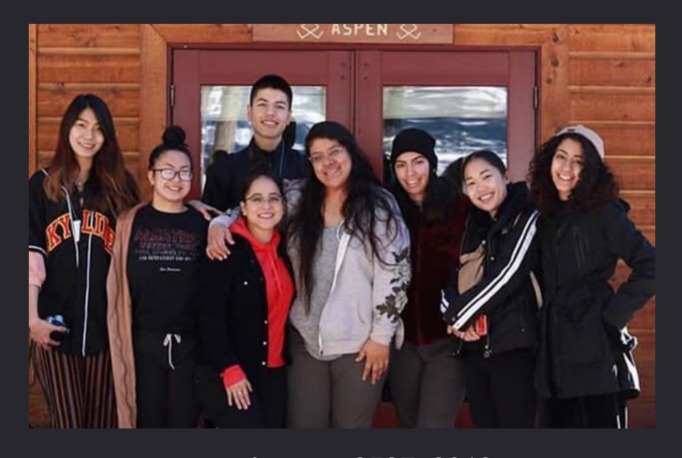
January 2527, 2019 ASSC officers went to Granlibakken in Tahoe City to plan for the Spring semester.