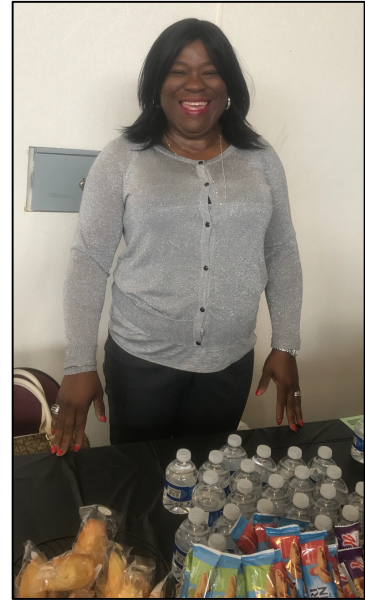
Hospitality class student gaining service training at the SSF Adult School job fair snack booth

In the fall semester, the NCATS identified the need for a more robust transition between ESL adult school classes and Skyline's ESOL classes. A project was identified to incorporate academic writing at adult school sites that would lead to placement into level 3 ESOL. In the spring semester, the new