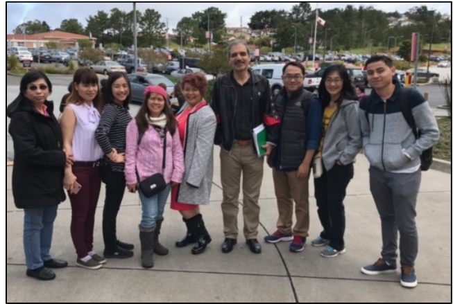
Adult School ESL students visiting Skyline College

Sequoia Adult School Scholars (SASS) is a non-profit organization with a mission to “empower low income adults, mostly immigrants working minimum wage jobs, by providing them with financial support, tutoring, and other assistance so they can continue their education, get higher paying jobs, and serve as role models and advocates for their children.” SASS has expanded to support current adult school students from Jefferson Adult School and South San Francisco Adult School who will be enrolling part-time at Skyline College, are BOG waiver eligible, and need help paying for textbooks and/or transportation. The scholarship will cover Skyline College bookstore textbooks and a bus pass or student parking pass. 4 students are slated to receive the SASS scholarship for fall 2017.