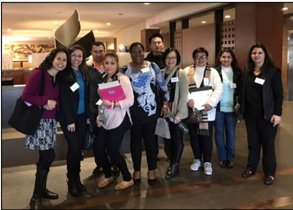
Hospitality class visiting the Doubletree Hotel

In the fall semester, 40 students completed the Hospitality Advance course (0 units). 23 students next attended HTM 124, Excellence in Service (0.5 units) with 17 enrolled in the course. 12 students attended HTM 125, Restaurant/Banquet Operations (1 unit) with 6 students enrolled. In the spring semester, 10 students attended HTM 101, Introduction to Hospitality and Tourism Management (3 units) with 4 enrolled. 8 students attended HTM 230, Hotel and Resort Management (3 units) with 5 enrolled. In the spring semester, students went on fieldtrips to visit the Doubletree Hotel and Marriot Hotel.