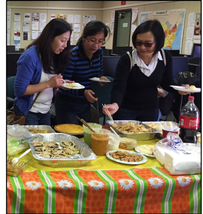
Digital literacy class celebrating the end of the semester with a potluck

6 students entered into the ServSafe class (food and alcohol safety training). 5 students completed the class and received ServSafe certifications.