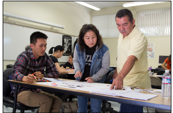
Hospitality students working on a project