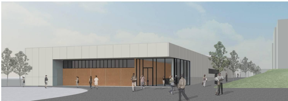
Building 4N as viewed from the drop off on the north side, looking southwest.