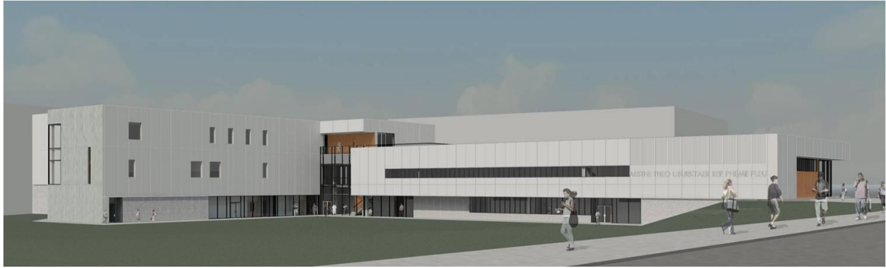
Building 4N as viewed from College Drive, looking west.

Here is a look at what the two new buildings will look like. Building 4N will house the Multicultural Center, Cosmetology, Classrooms and the administrative offices. Building 11N will serve the Automotive Technology program.