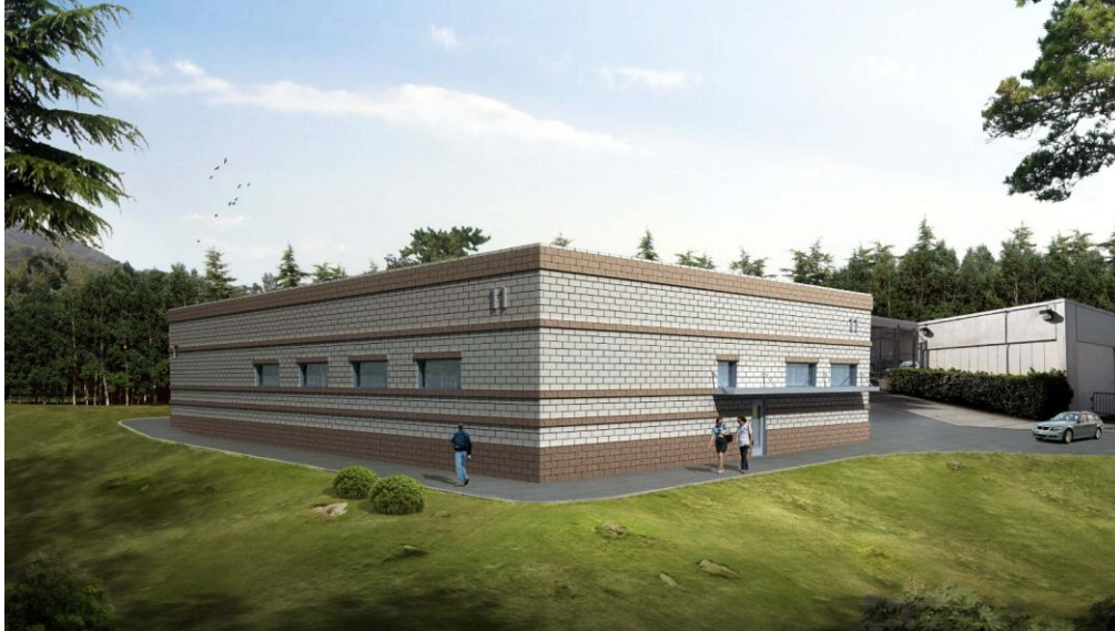
Building 11 as viewed from the south west side (Building 1, the Gallery, is in the background.)