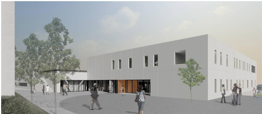
Building 4N as viewed from the center of campus, looking northeast.