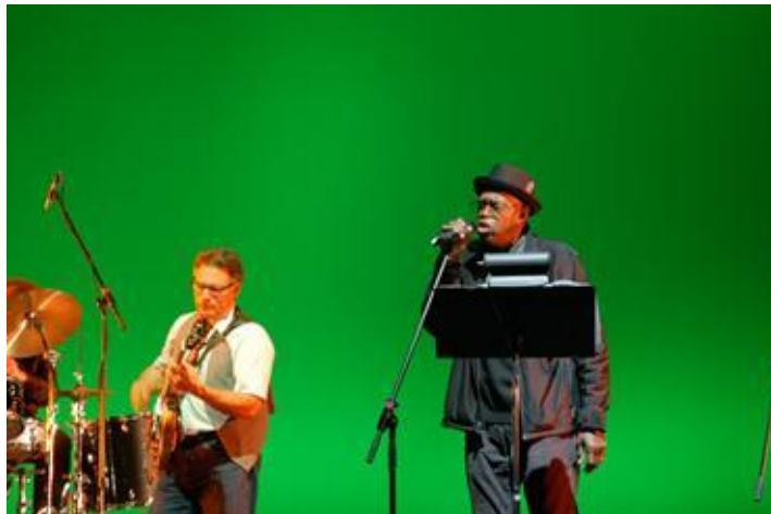
Malcolm Mooney in Concert at Skyline College Theater

http://www.facebook.com/pages/Skyline-College-Art-Gallery/102258493146760