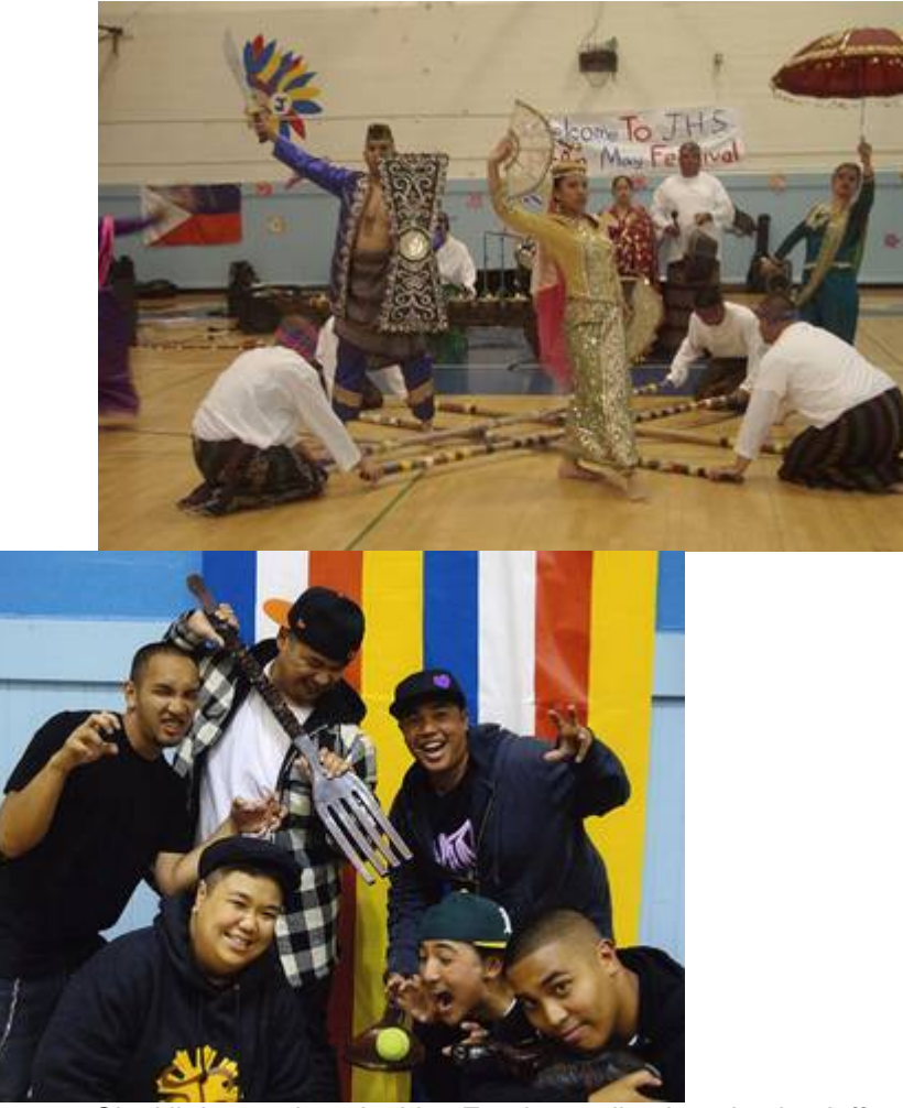
Singkil dance photo by Liza Erpelo; studio photo by the Jefferson High School Photo Club.