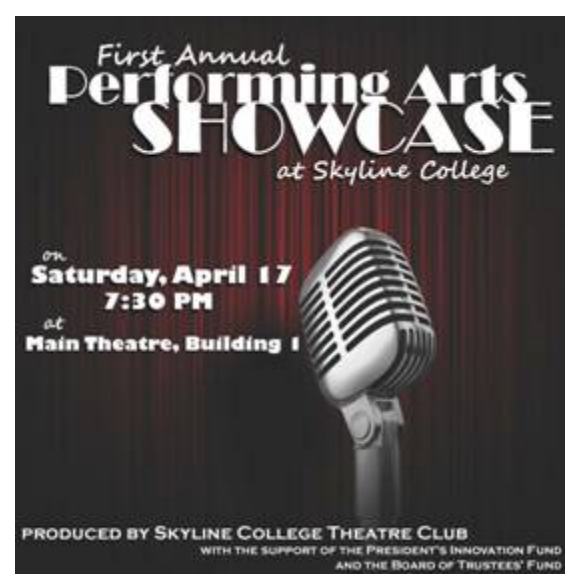
1st Annual Skyline Performing Arts