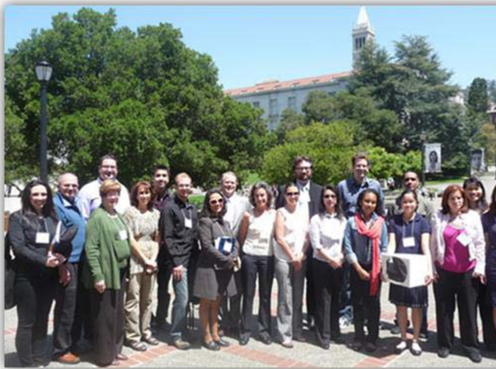
Presenters, supporters and friends at the Honors Symposium