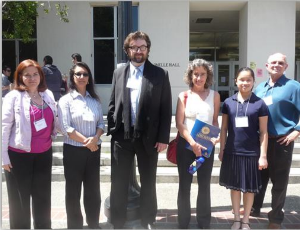
Mentors and students at the Honors Symposium