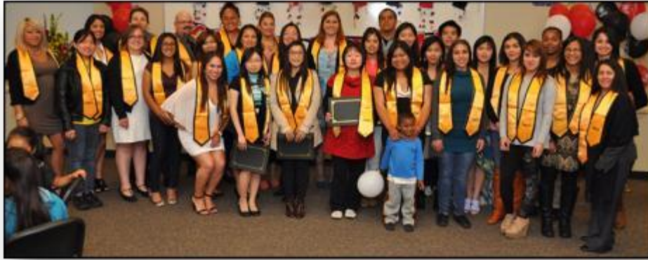
2013 Certificate, Graduate & Transfer Students.

On May 3rd the TRiO Student Support Services (SSS) Project held its annual “End of the Year Celebration” in recognition of the TRiO SSS students who were receiving a certificate and/or associate degree and/or transferring to an institution of higher education, along with thirty students selected this year to receive grant-in-aid financial support of $1000 each. Students, family members and Skyline College administrators, faculty, and staff were regaled with an elegant buffet dinner prepared by Pacific Dining. The event attracted more than 135 attendees.