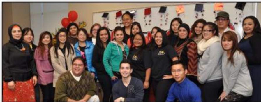
2013 Grant Aid Recipients.