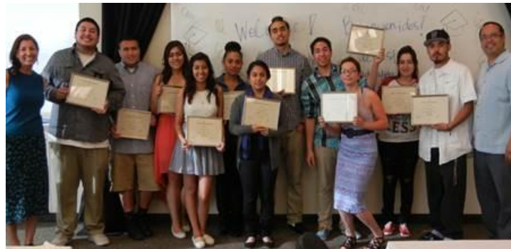
The Puente Program’s Class of 2012-2013

The Skyline College Puente Program had its “End of the Year Celebration” Friday, May 3, 2013, to celebrate students who have completed one year in the program, received scholarships, were receiving their A.A.’s and A.S.’s, or were transferring to a four-year college. They also gave thanks to the mentors who had helped guide them over the past year.