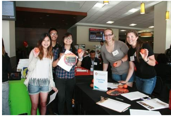
Fall Job Fair