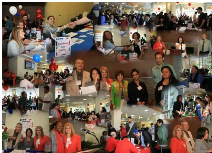
Career Network Night