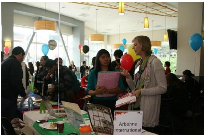
San Mateo Job Fair