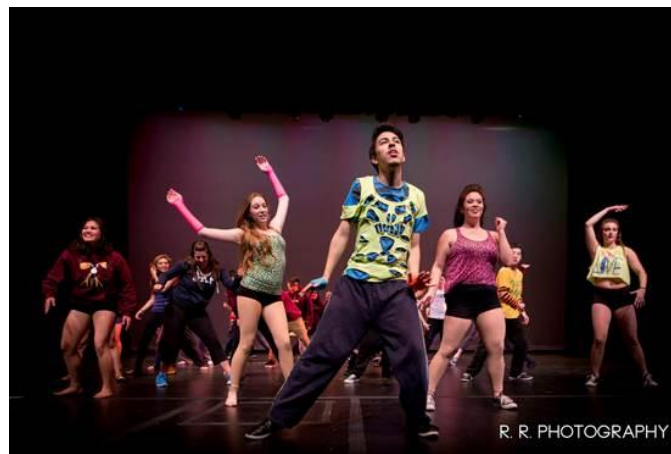
College of San Mateo Dancers