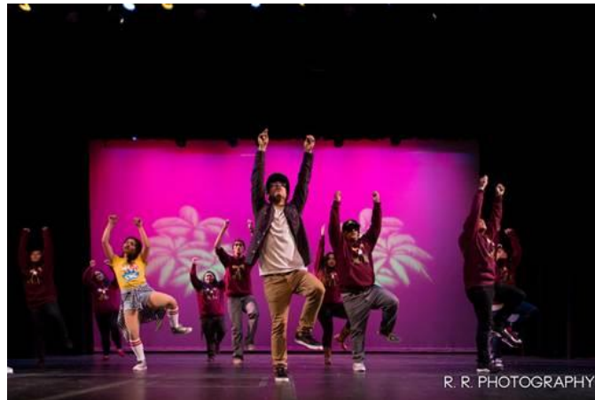
Flash Mob Finale