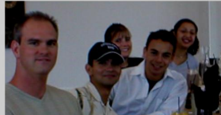
Recent Pister Scholars at a Campus Event.

The program provides a $20,000 scholarship distributed over two years, mentoring and academic support, and assistance in finding paid or volunteer summer work experience, co-sponsored by private- and public-sector employers. Recipients will be selected by the chancellor of UCSC from candidates submitted by the presidents of participating community colleges.