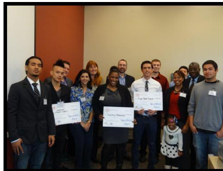
Pictured above 1 st , 2 nd and 3 rd place Competition Winners, Judges and YEP/CITD Staff.