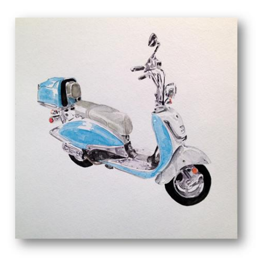
Ilana Crispi, Scooter, Watercolor on Paper

You can view pictures of the exhibit in the Faculty 2012 show Photo Album at the Gallery's Facebook page: <u>http://www.facebook.com/skygallery</u>