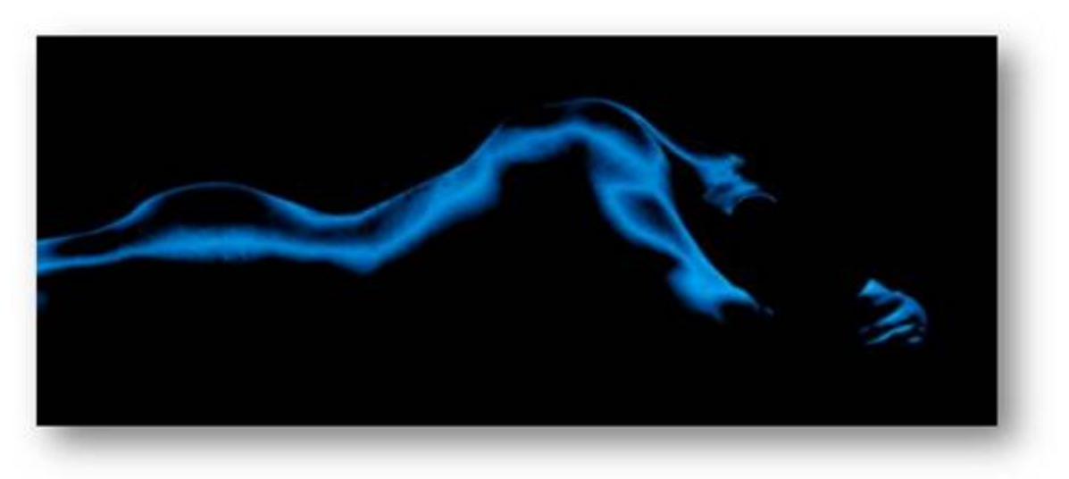
Arthur Takayama, Electric Blue, Photograph