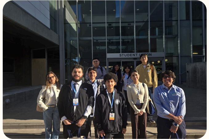
MESA and STEM students attend CED @ San José State

MESA and STEM students participated in the 2025 Conference for Engineering Diversity (CED) at San José State University. CED is an annual event dedicated to fostering inclusivity, innovation, and professional growth within the engineering community. The conference celebrates the power of diversity to drive innovation and shape