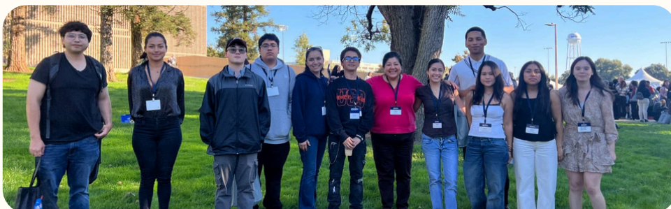
Skyline College and College of San Mateo MESA students at the 23 rd annual UC Davis Pre-Health Conference

Skyline College and College of San Mateo MESA students attended the 23rd annual Pre-Health Conference at UC Davis, the nation's largest. The event included keynote speakers, deans panels, admissions workshops, and a pre-health fair covering diverse health professions—from medicine and veterinary medicine to nursing, dentistry, pharmacy, therapy, and more. Students connected with health professionals, admissions officers, faculty, and deans through interactive workshops and networking sessions.