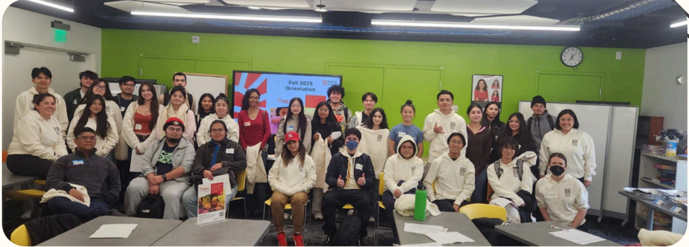
MESA Fall 2025 Orientation