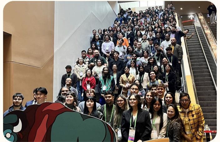
MESA students from across California at SACNAS

events in the country. The annual conference brings together thousands of students, professionals, and researchers from across the country to celebrate culture, share cutting-edge research, and expand opportunities for underrepresented groups in science. Read more in Skyline Shines .