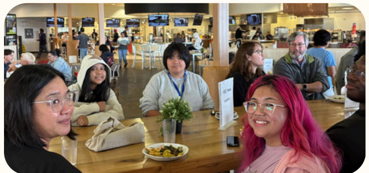
MESA students dine at CSUEB with STEM faculty and staff

Skyline MESA students were welcomed at CSU East Bay by the CSUEB MESA community. The day began with a warm welcome from the CSUEB MESA staff and the College of Science Dean. Students then explored the campus through a guided tour,