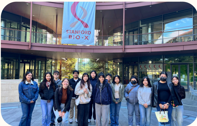
MESA students at Stanford Bio-X

gain technical skills, and grow more confident with guidance and mentorship. The university visits offered students an inside look at cutting edge research in Stanford Bio Labs, the chance to hear from their peers who completed the CCOP internship, and gain insight into life as a researcher and the many career paths available in STEM. Read more in Skyline Shines .