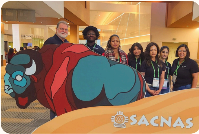
Skyline College MESA students and faculty at SACNAS