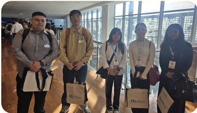
MESA and STEM students attend CED @ San José State

the future of the industry. Through engaging workshops, insightful panels, and interactive sessions led by industry professionals, students gained valuable exposure to topics such as professional development, career preparation, and the role of AI across various engineering fields. Read more in Skyline Shines .