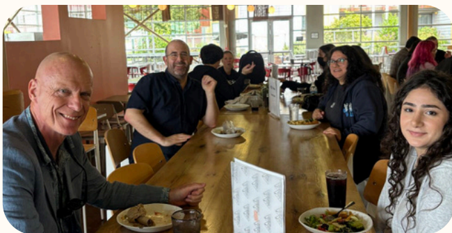
MESA students dine at CSUEB with STEM faculty and staff

enjoyed a networking lunch with STEM faculty and staff at the Dining Commons, and participated in a department showcase in the Student Center CORE building. The visit concluded with an engaging student panel in the STEM Lab, with recent Skyline grads. Read more in Skyline Shines .