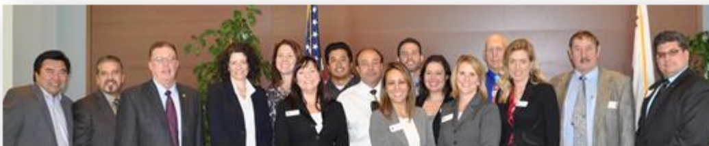
The 2013 San Bruno Chamber of Commerce Board of Directors.