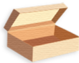
Feedback and Suggestion Box

One way to submit it is through our general e-Suggestion Box , via the hyperlink in the box below http://skylinecollege.edu/publicinformationoffice/feedback.php