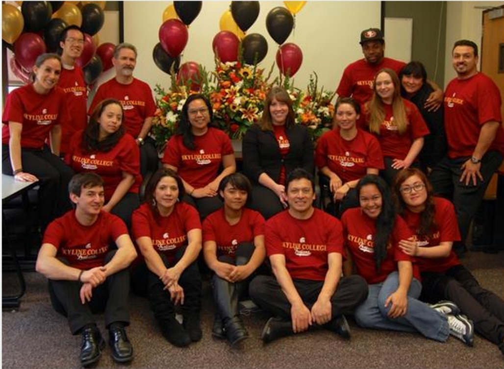
Event Staff