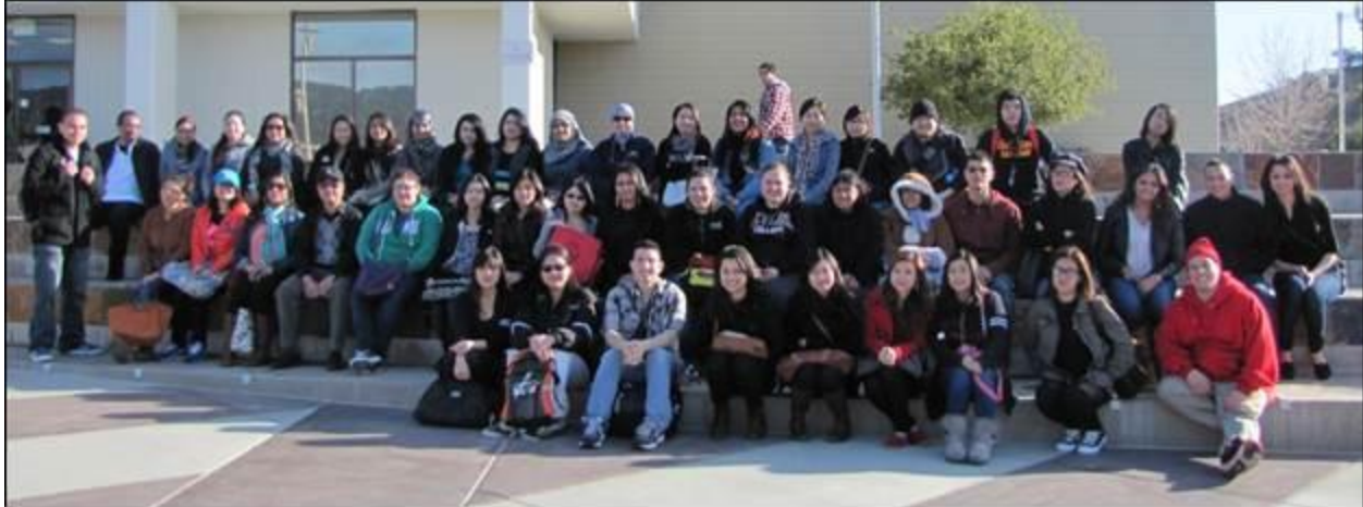
--H. Con. Res. 278 (Concurrent Resolution designating February 28, 1986 as National TRiO Day)

“National TRiO Day,” a day on which the nation is asked to turn its attention to the needs of disadvantaged young people and adults aspiring to improve their lives, to the investment necessary if they are to be-come contributing citizens of this country, and to the talent which will be wasted if that investment is not made.