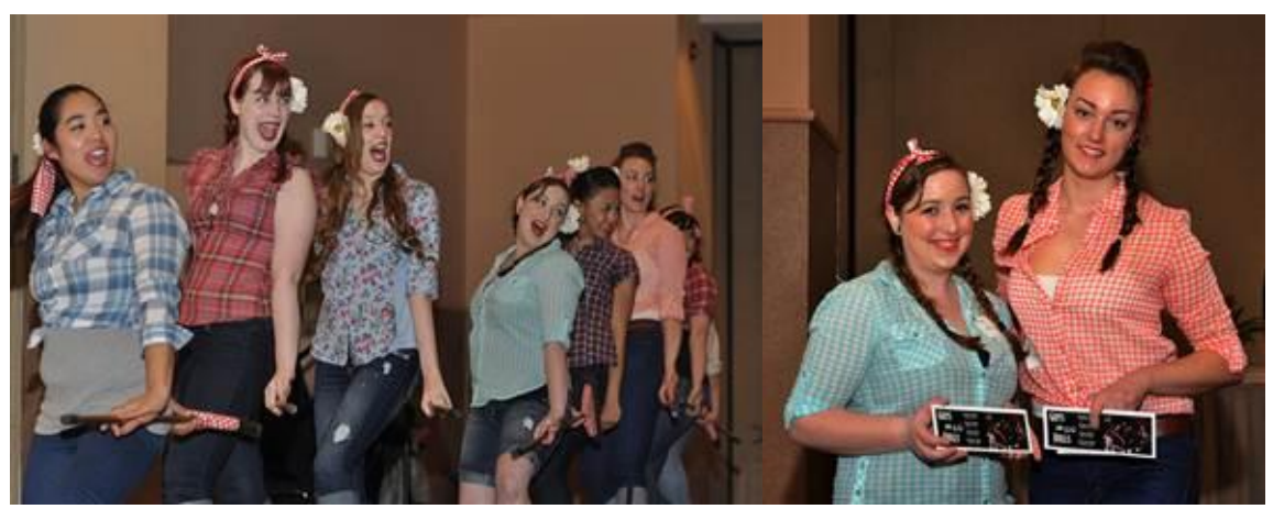
Dancers of Guys and Dolls Production

Faculty, staff, students and administrators from the college provided their support in event preparation and attendance. Dancers from the Skyline College production of Guys and Dolls started us off with a great rendition of "A Bushel and A Peck"!