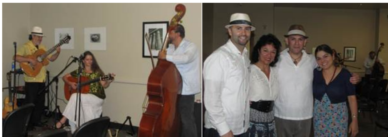
Left – Cascada de Flores performs music of the Americas.