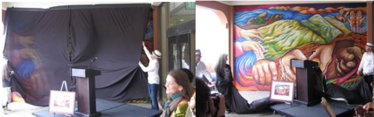
The unveiling of Earth Book in front of the main entrance of Building 2